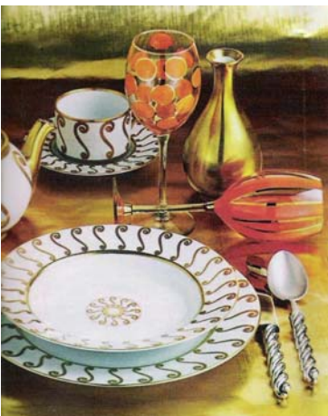
Marc Blackwell Tableware

Official Inaugural Plate front (top) and back.